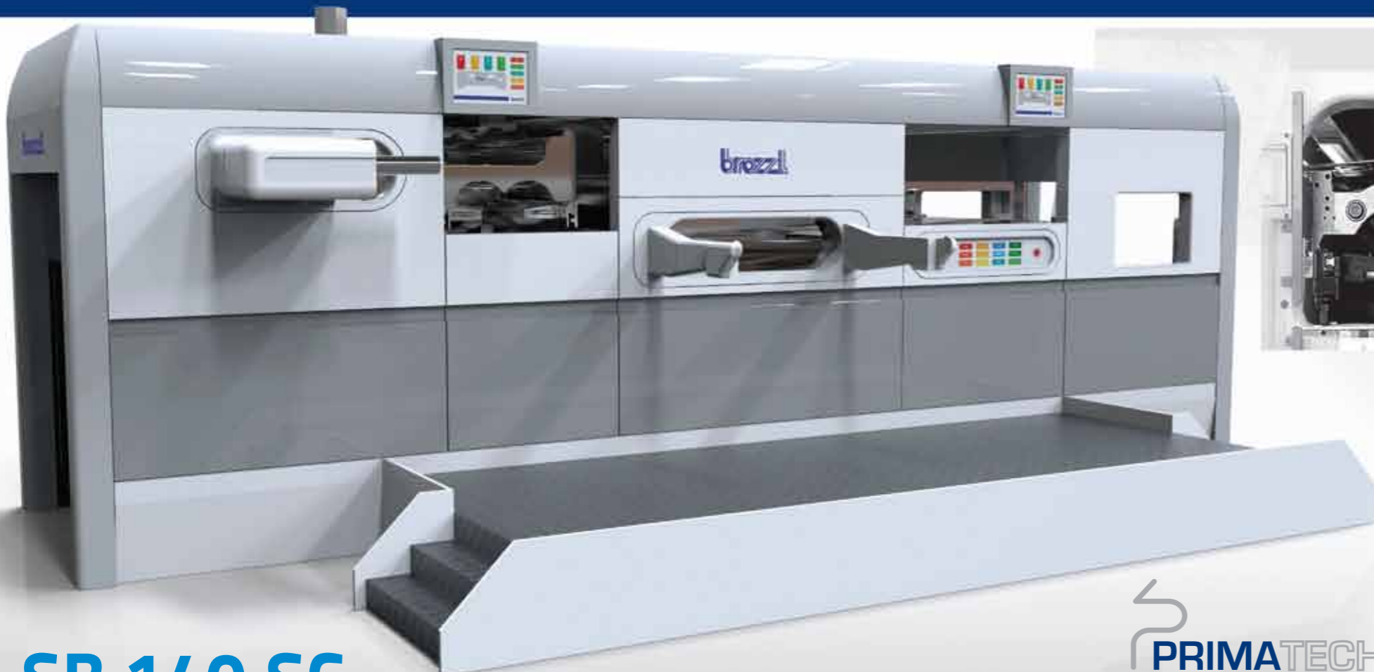
SB 140 SC full automatic hot stamping